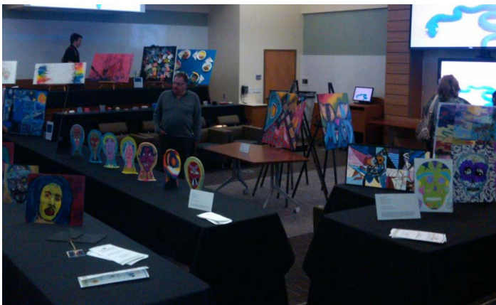
Pasco County Prodigy Showcase