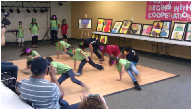
One of the Hillsborough County Prodigy Showcases